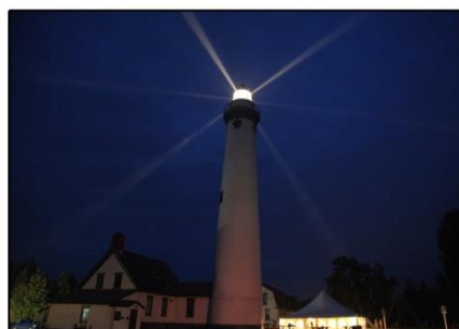
Left photo: Sunset kayak adventure, courtesy Paul Gerow; Top Right photo: Rockport State Recreation Area sky at dusk, courtesy Paul Gerow; Bottom Right photo: New Presque Isle Lighthouse near Rockport State Recreation Area, courtesy Pure North Photography.